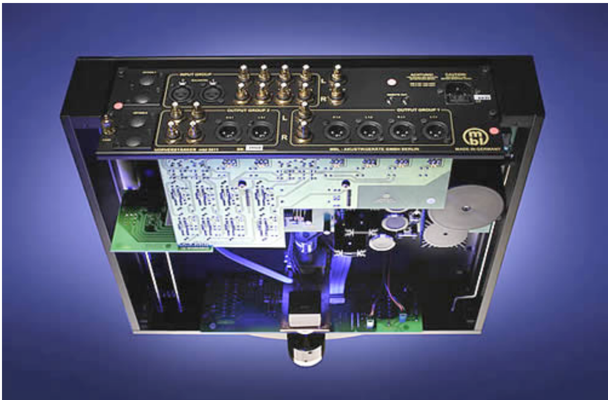
The electronic of this preamplifier are a "delicacy" which satisfies even the highest aspirations.